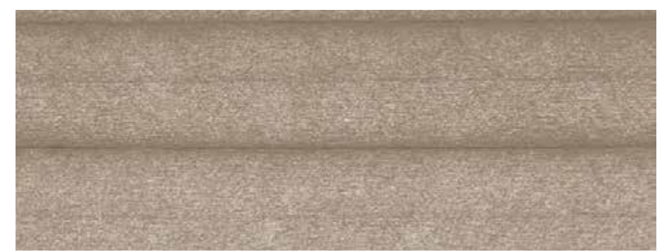
773-02 DAWN 45