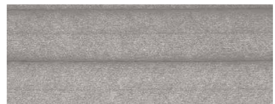
773-03 MOUSE 45