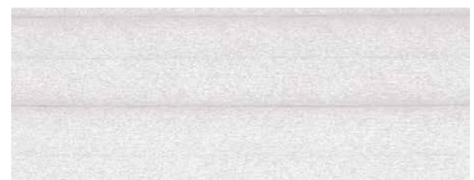
773-01 WHITE 45